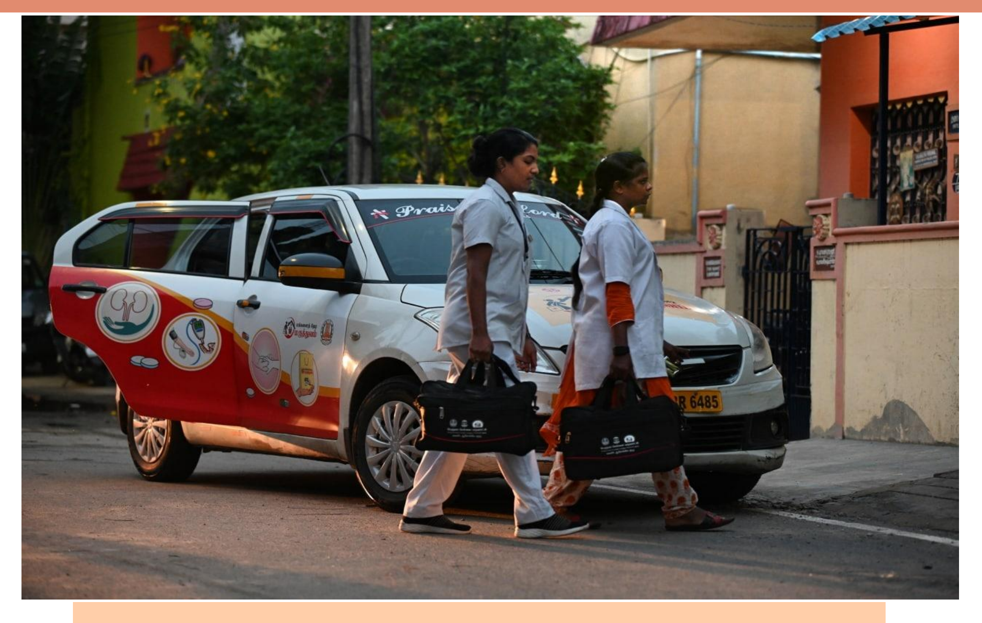
Palliative Care Nurse and Physiotherapist